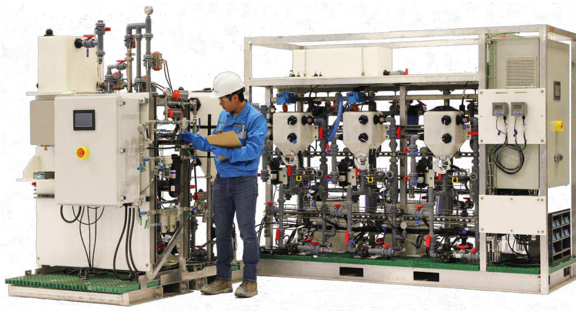
Figure 2: BrineRefine Pilot Unit

BrineRefine is a smart and compact chemical softening system that applies modern automation and separation processes to remove scaling compounds. Innovations include: