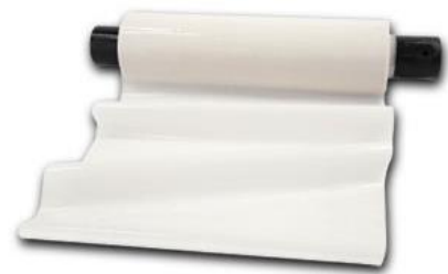
Saltworks' IonFlux Ion Exchange Membranes